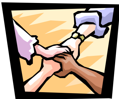
It is NOT interference for Team Managers to manage their members' interactions.

your team clear directions and to provide a positive atmosphere. One great way to do this is to have your team generate a list of Team Ground Rules. If you have any house rules of your own, this is the time to add them, but keep your rules to a minimum. I have only a couple: no running inside, no going