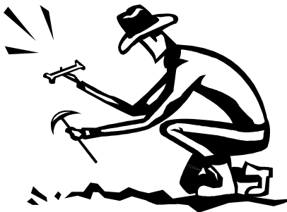
Dust off your fedoras, bomber jackets and bullwhips—InDIana Jones is coming!

We at DI Base Camp were so tickled by the idea of a kid-planned theme that we decided to open up the 2010 tournament to other kids in the region. Besides, kids have the BEST ideas! Do any of your children have tournament themes they'd love to see us do? We're putting contest ideas together now. Watch future newsletters for more information about this exciting opportunity.