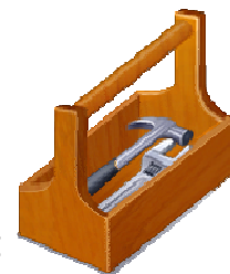
Give your team a full tool box!

CPS Tools takes place at Eureka School, 5455 Eureka Rd, Granite Bay, from 8:30 till noon. Continental breakfast provided. $10.00 per person. Register with Shelley Larkin Bush by December 10 at 916-782-2304 or by email: wildfluers@yahoo.co.uk or rdshelleylarkinbush@yahoo.com